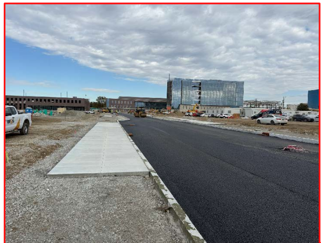
Paving along Holly St.

Note: For weekly, more detailed construction updates, visit indy.gov : White River Innovation District .