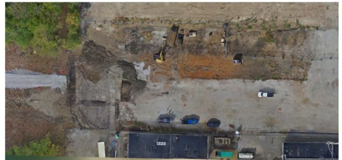
Aerial Image of Henry St Bridge Project Site, Courtesy of Stantec.