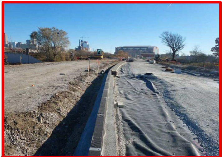
Completed granite curb along Henry Street

Note: For weekly, more detailed construction updates, visit indy.gov : White River Innovation District.